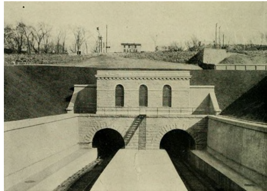
Historic image of North River Tunnel portal, North Bergen, NJ